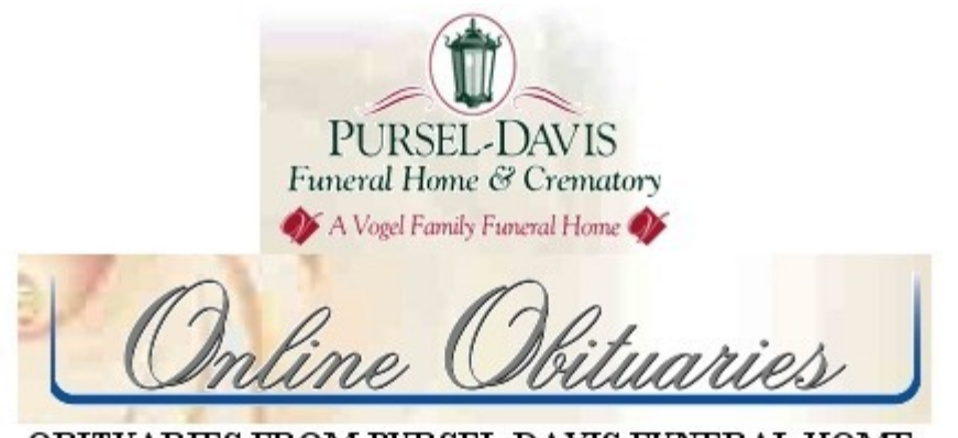
OBITUARIES FROM PURSEL-DAVIS FUNERAL HOME MARSHALLTOWN, IOWA